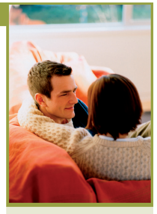
"Acoustic glass helps eliminate annoying high-frequency sounds"

Acoustic glass consists of two panes of glass which have been laminated together using PVB (Polyvinyl Butyral). PVB is an acoustic membrane which bonds the two panes of glass together to give the appearance of a single pane of glass.